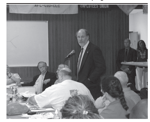
Senator Corzine addressing Council delegates

stitutions and pledged to impose a far greater degree of central oversight and accountability over the nine State colleges/universities.