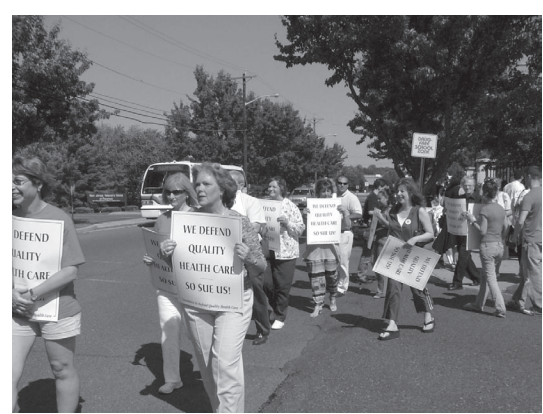
HPAE demonstrators at Bergen Regional Medical Center

On June 23, the nurses and health professionals at BRMC went back to work after reaching a contract agreement with the hospital. "We have moved forward in our goals of achieving safe